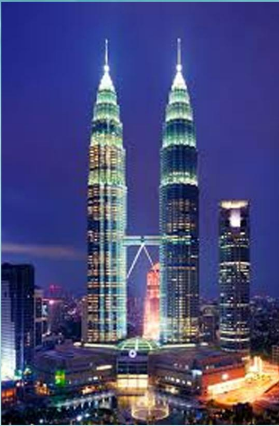
PETRONAS TWIN TOWERS